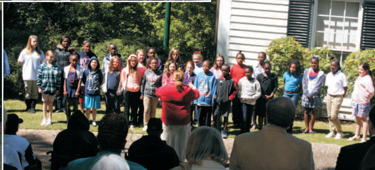
The 5th Grade chorus from a nearby school sings "America the Beautiful"