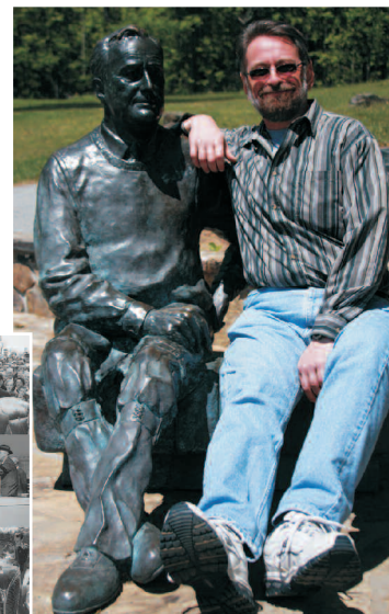
FDR and I take a time out at his favorite picnic spot in Warm Springs.

Please download my DRIVING WITH FDR MINIBOOK , on my website, www.DrivingWithFDR.com (it's free!). I think that you would like it...and I hope that you do!